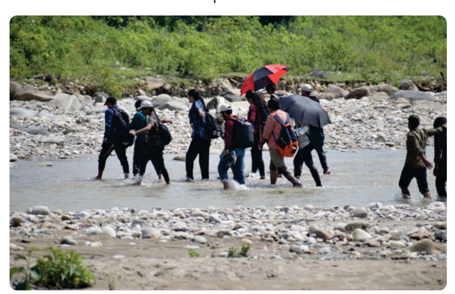
Riparian Ecosystem Visit at the Saharanpur Forest Division