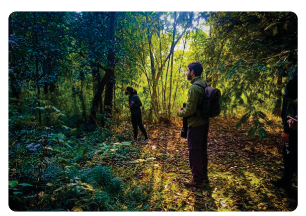
An excursion into the Reserve Forest at FRIDU campus