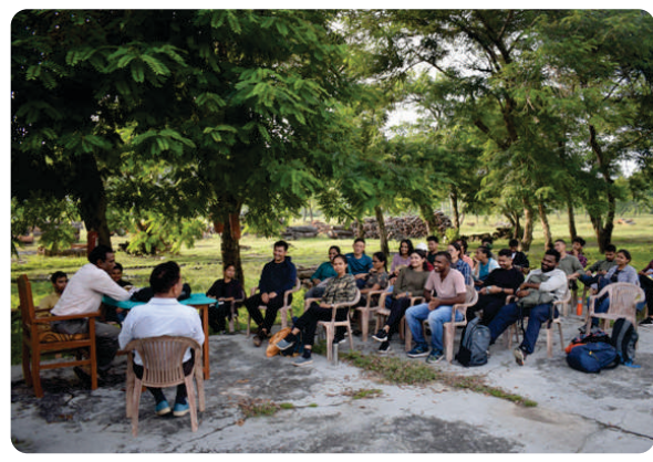
A group interaction at Saharanpur Wood Depot, Uttar Pradesh