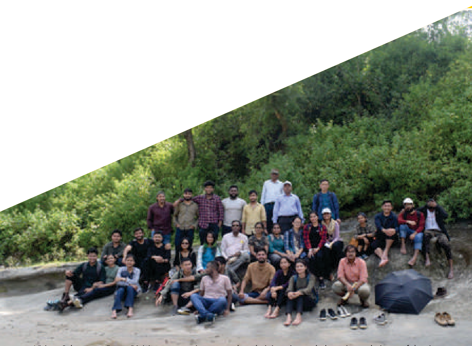
Visit to Saharanpur Forest Division to get quittance on the administration and plantation techniques of the site